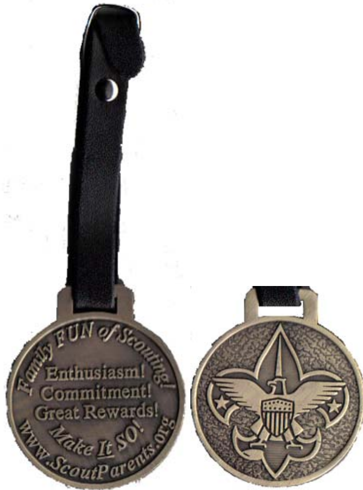
Medallion on leather strap given to all persons attending the dedication.