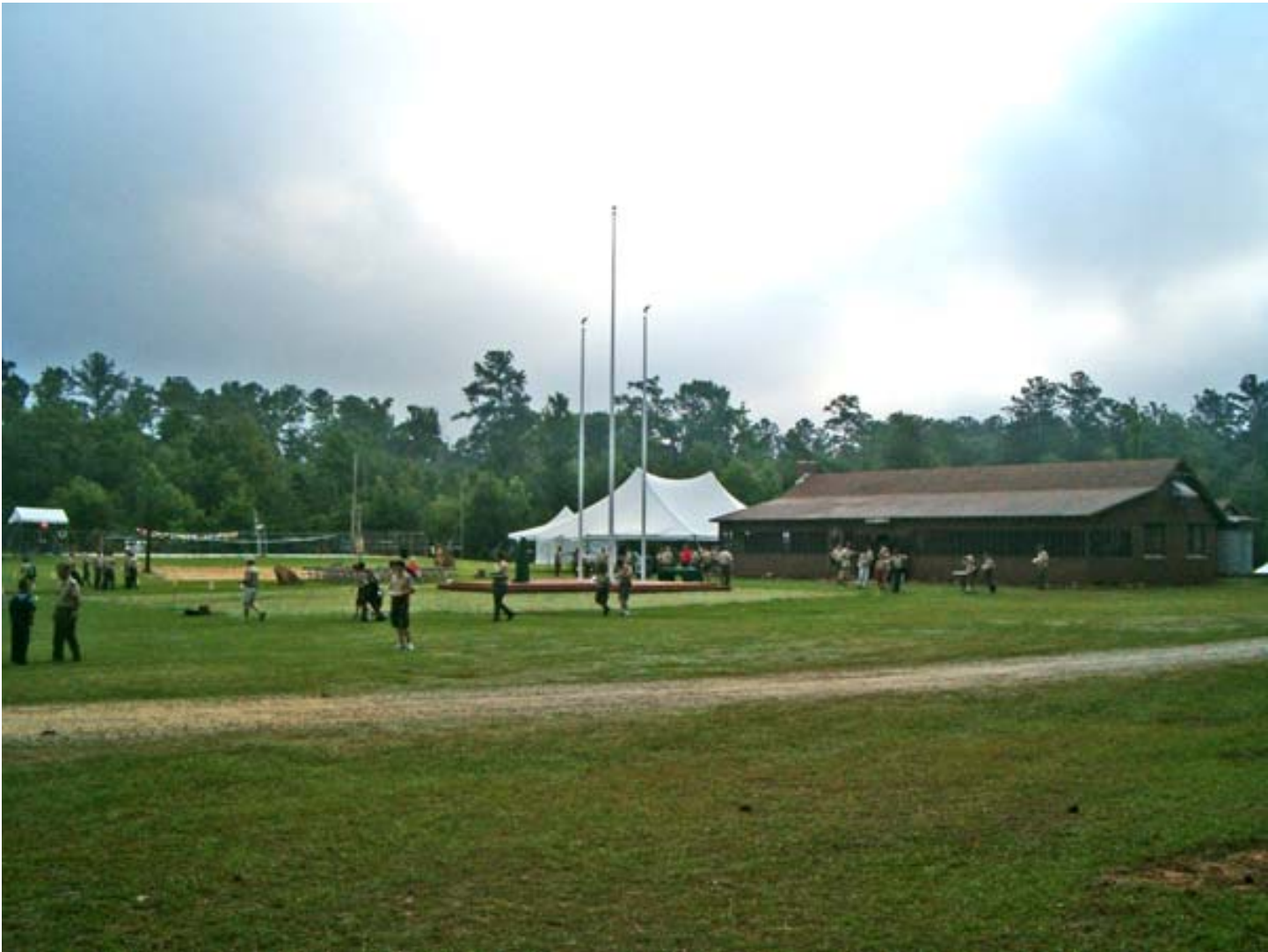
View of the monument from the Eagle Pavilion.