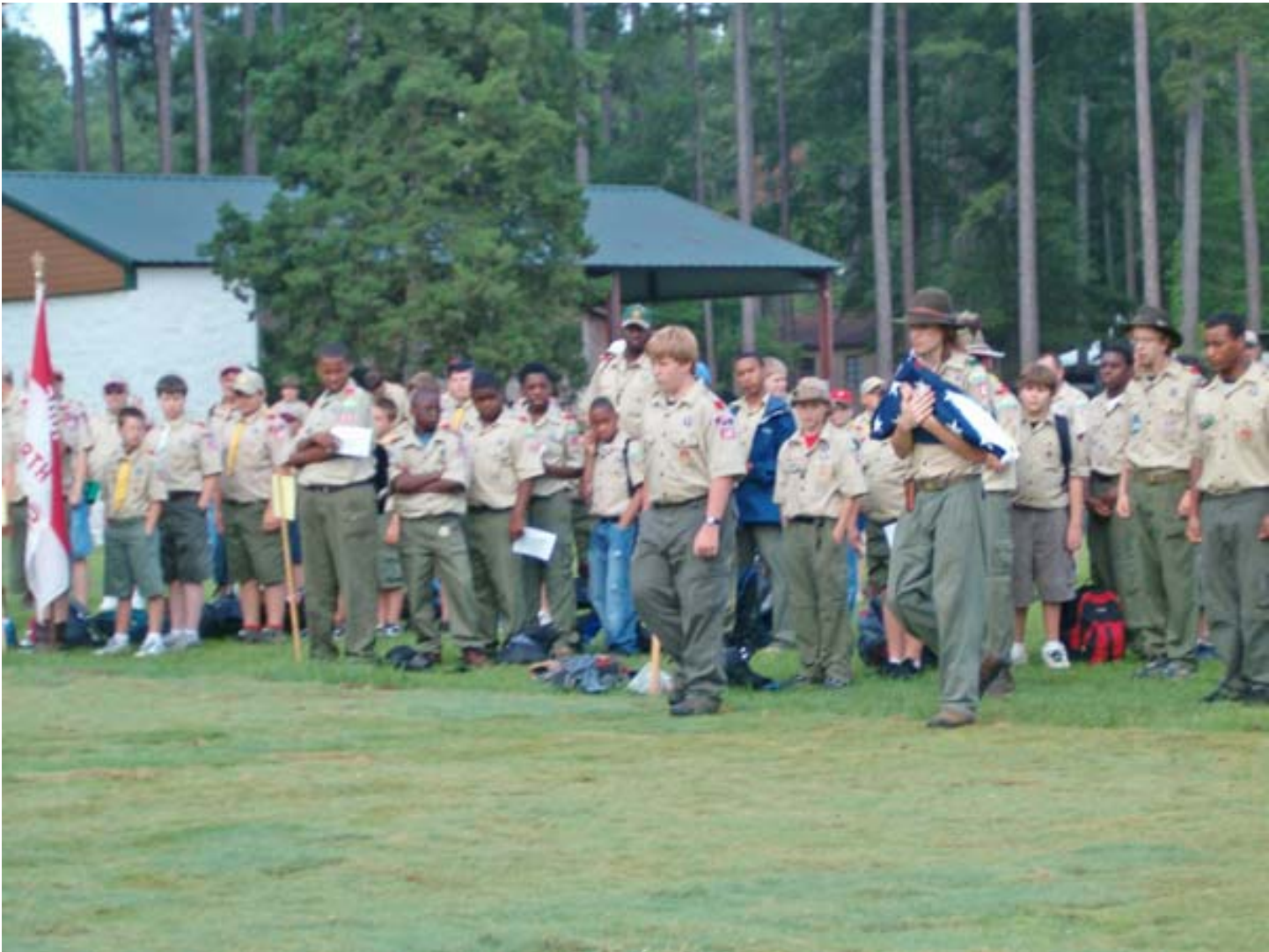
The color guard presenting the colors.