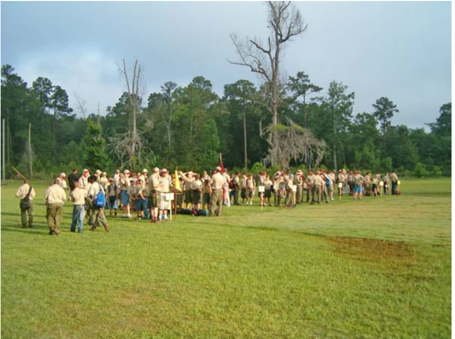
The ceremony was held on Monday morning of the first week of summer camp. The campers lined up after breakfast