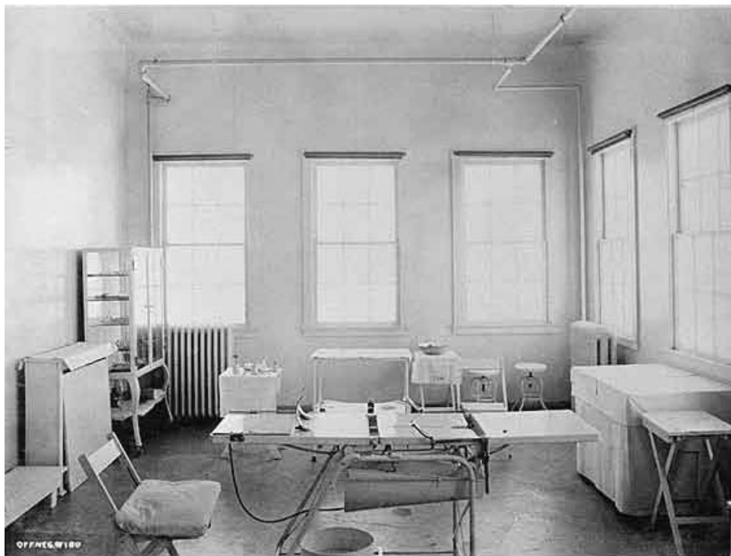
Interior of operating room at Souther Field, in 1918. Souther Field was a military aviation training camp established by the War Department at this time.