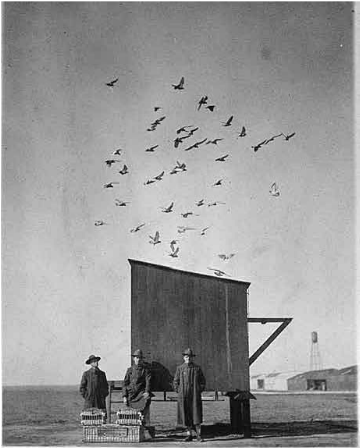
Carrier pigeons and a pigeon house at Souther Field in 1918.

From the Vanishing Georgia Collection Georgia Division of Archives, Offices of Secretary of State