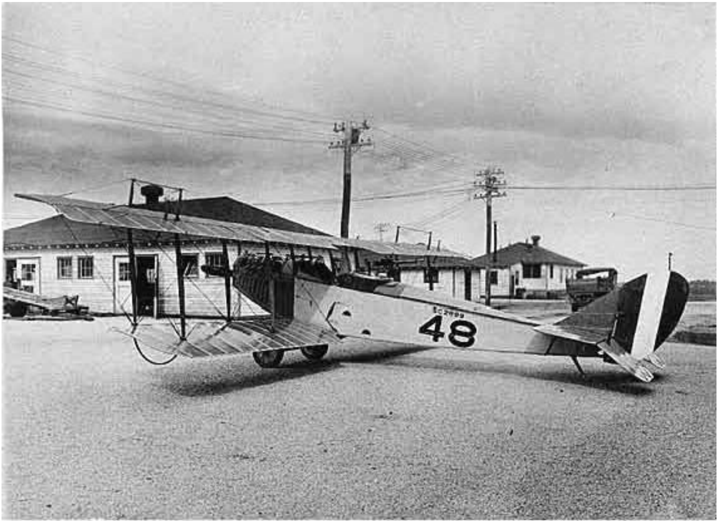
Machine gun airplane at Souther Field in 1918