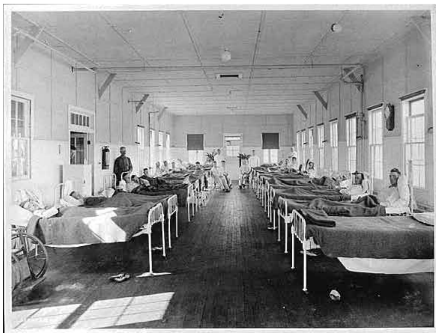
Interior of a hospital ward at Souther Field in 1918.