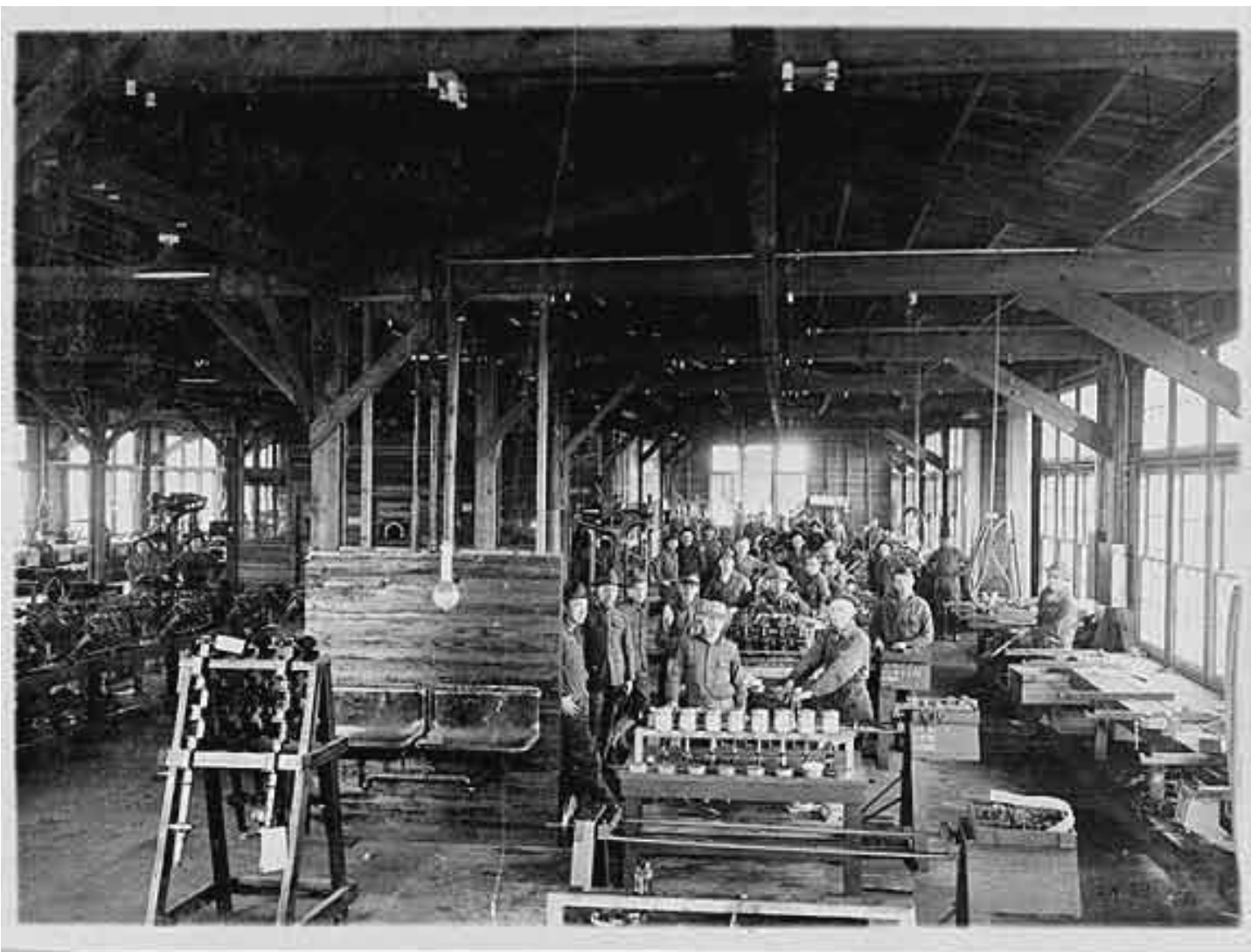
Interior of machine shop at Souther Field in 1918 showing Army personnel working on airplane engines.