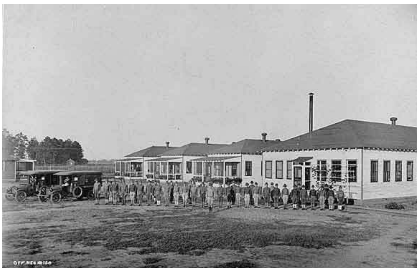
Hospital buildings at Souther Field in 1918 with medical personnel shown standing in front.