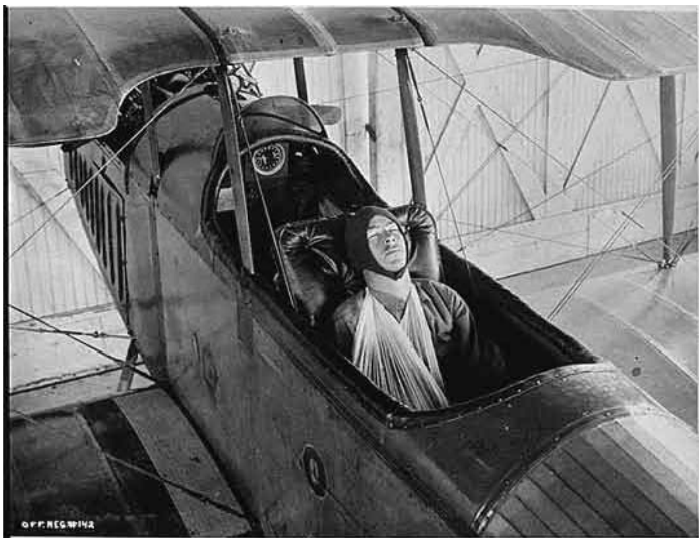
Sumter County, 1918. Close-up of hospital airplane used for the transportation of sick and wounded at South Field. The Field, located four miles northeast of Americus, was established by the War Department as a military aviation training camp. Note the wounded soldier.