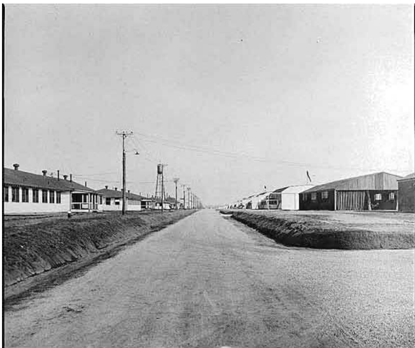
Main Street at Souther Field in 1918. Airplane hangars seen at right.

From the Vanishing Georgia Collection Georgia Division of Archives, Offices of Secretary of State.