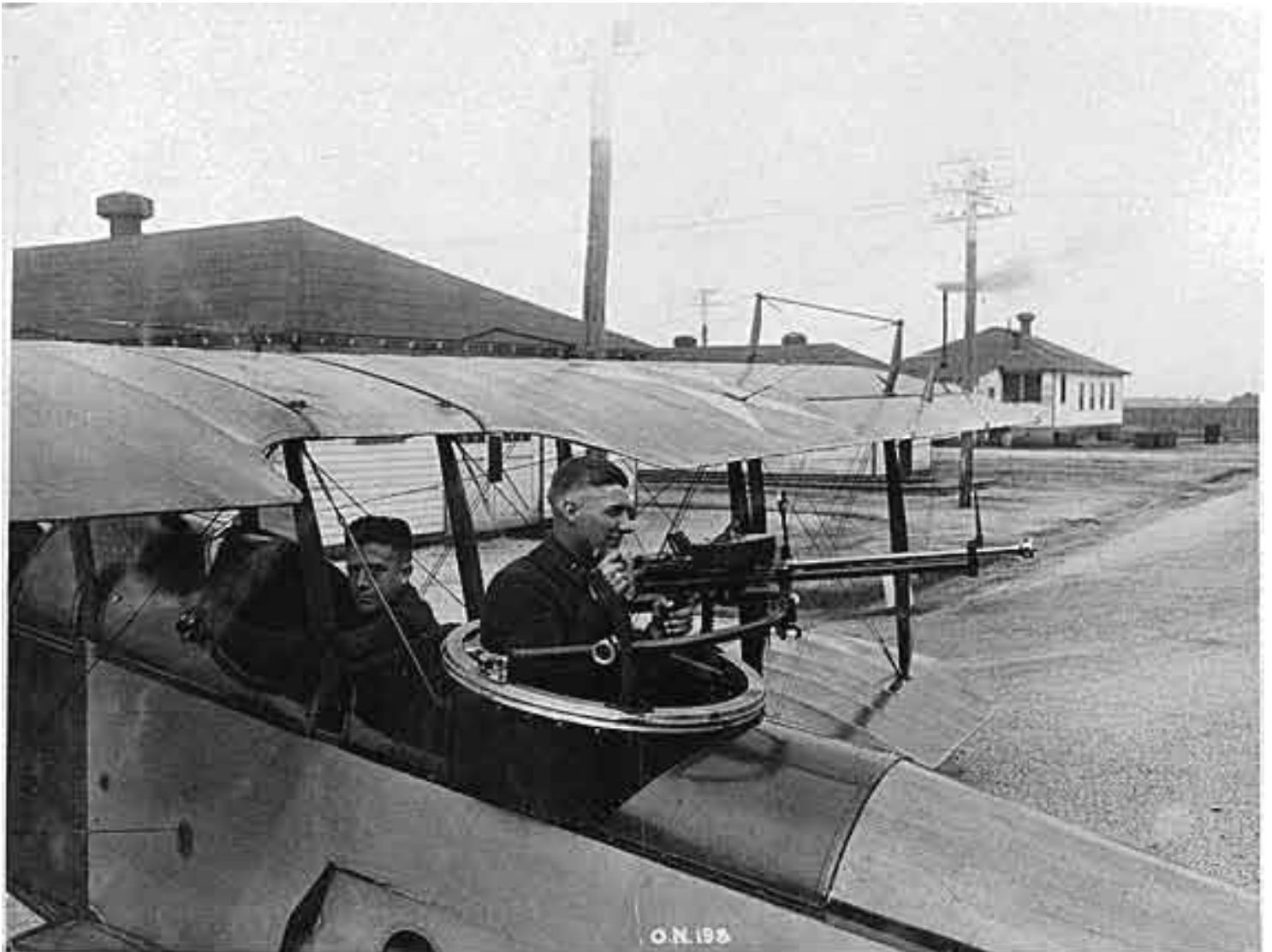
Close-up of machine gun airplane at Souther Field in 1918.

In 1920 Troop 1 of Americus assisted with the Fourth of July celebration at Souther Army Air Field. Three of the boys won trips in airplanes. These photos are from 1918 and give a good idea of what the area looked like as scouting began in the Americus area.