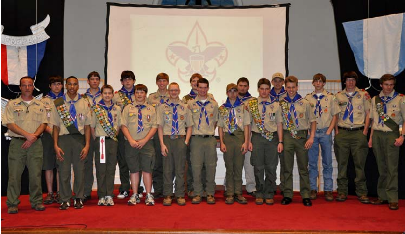
The banquet was held March 3, 2011 at Avalon Methodist Church, Albany.