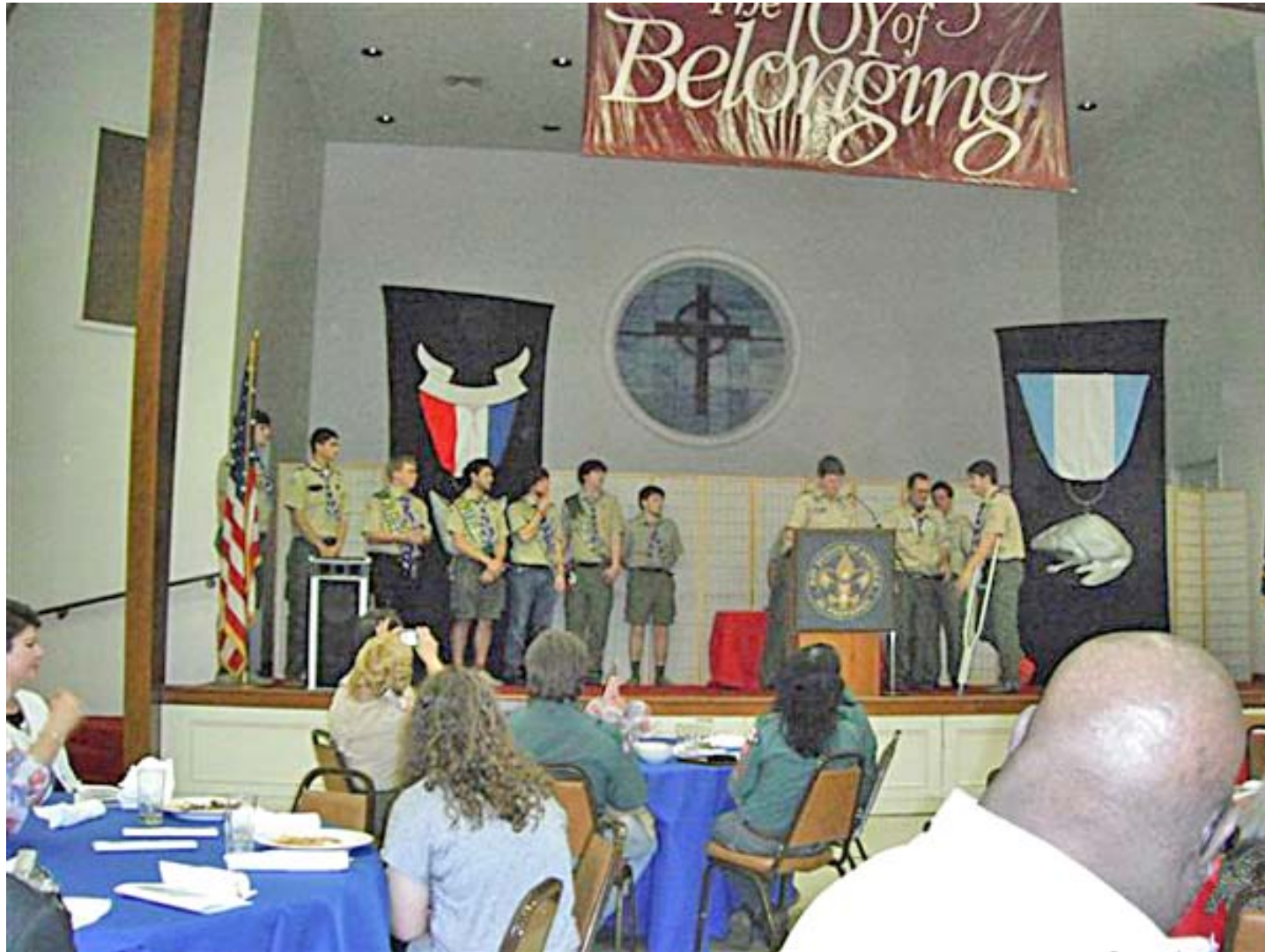
The banquet was held in March 2012 at Avalon Methodist Church, Albany.