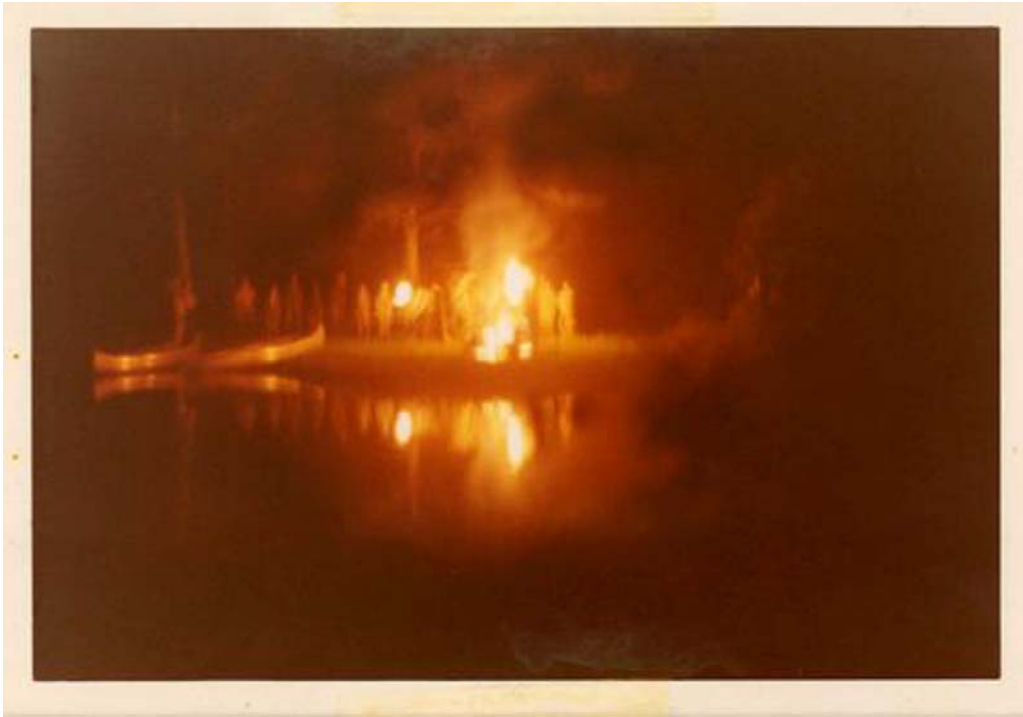
A night photo of the Blue Hole in 1971 at an OA tap-out. The photographer was standing where the audience was seated which was between the pool and the Blue Hole looking across the Blue Hole to the where the candidates were taken to be marched off into the woods.