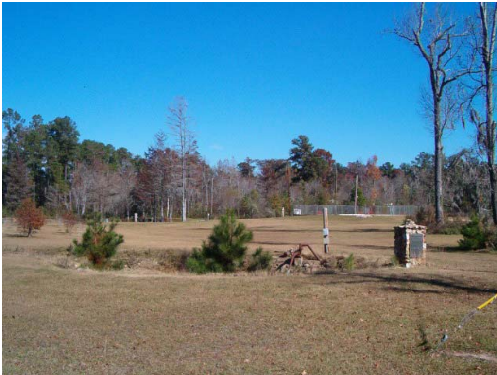
Jasmine Spring (looking from trading post to the northeast toward the pool)

In 1999, a tornado struck Camp Osborn and took out most all of the big trees around Jasmine Spring and the Blue Hole. From 2000 until 2002 a sever drought caused Jasmine Springs (an artesian well) to complete dry up. After the drought broke beavers dammed up Mill Creek so bad than when it rained the main part of camp would flood. To solve the flooding problem, Worth County came in and cleared out the channel and did drainage work around the Blue Hole and Mill Creek at the main camp. From 2002 until 2009 the spring did not flow but was full due to water backup from the Blue Hole. It was 2010 before the spring began flowing clear water again. The photos below show the results of those 5 years.