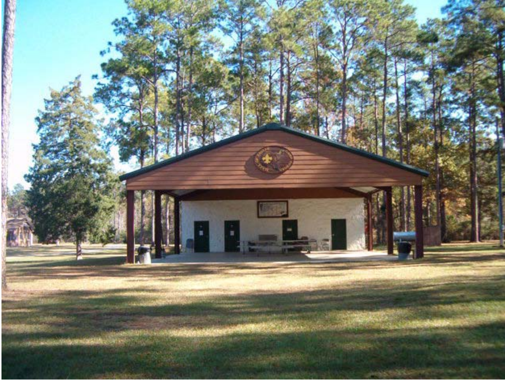
The Eagle Pavilion is located behind the Administrative Building in the location of the original dining hall.