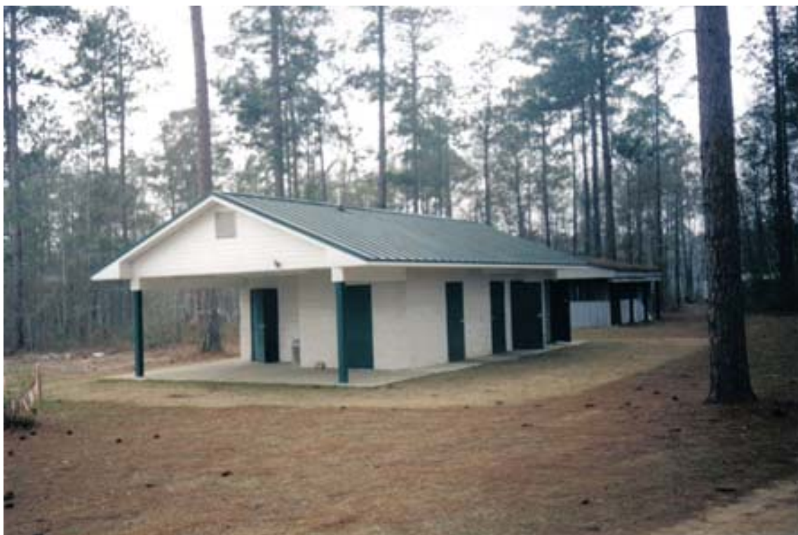
Bathrooms built on the ridge. The building contained 8 private bath/shower unites. Constructed in 2000. An identical building was built in the main camp near the shooting range.