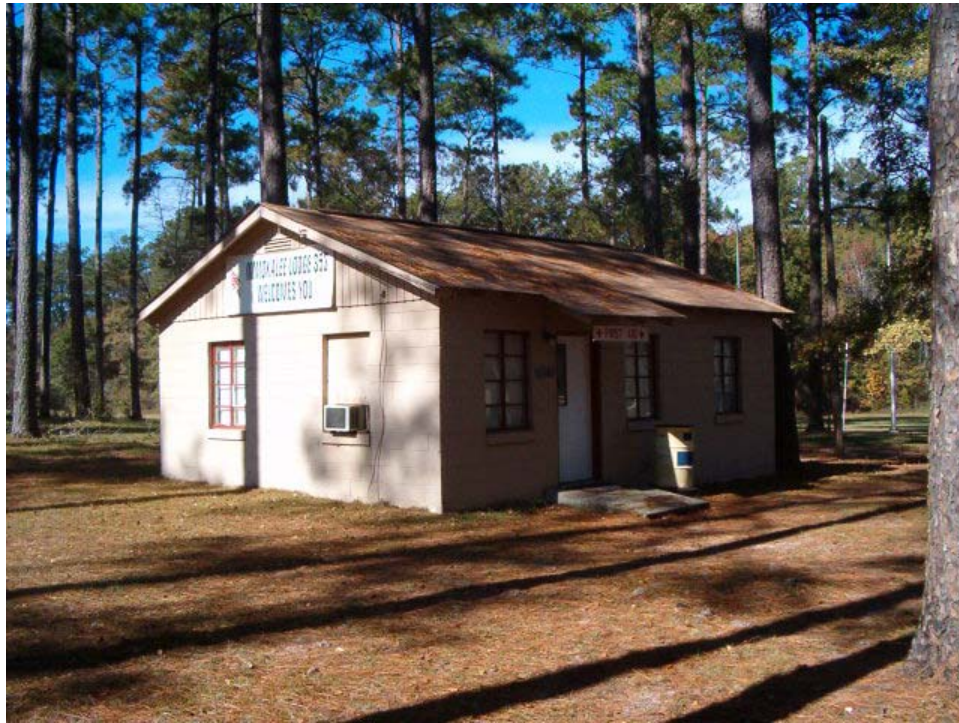
First Aid Building in 2007 (above) and in the 1950s (below).